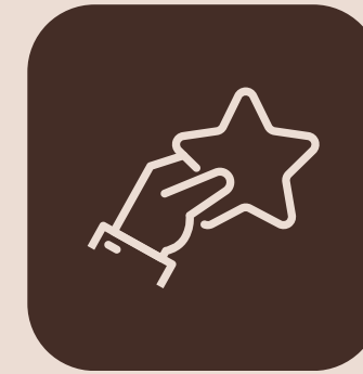
Customer Satisfaction Ratings