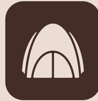
Significant Carbon Offset